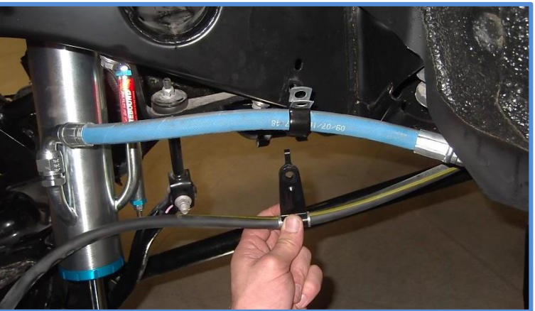
IMPORTANT: Read all instructions thoroughly from start to finish before beginning the install. Check parts list and make sure all parts are included in the kit. If the instructions are not properly followed severe frame, driveline and/or suspension damage may result. Check for frame and suspension damage prior to installation.