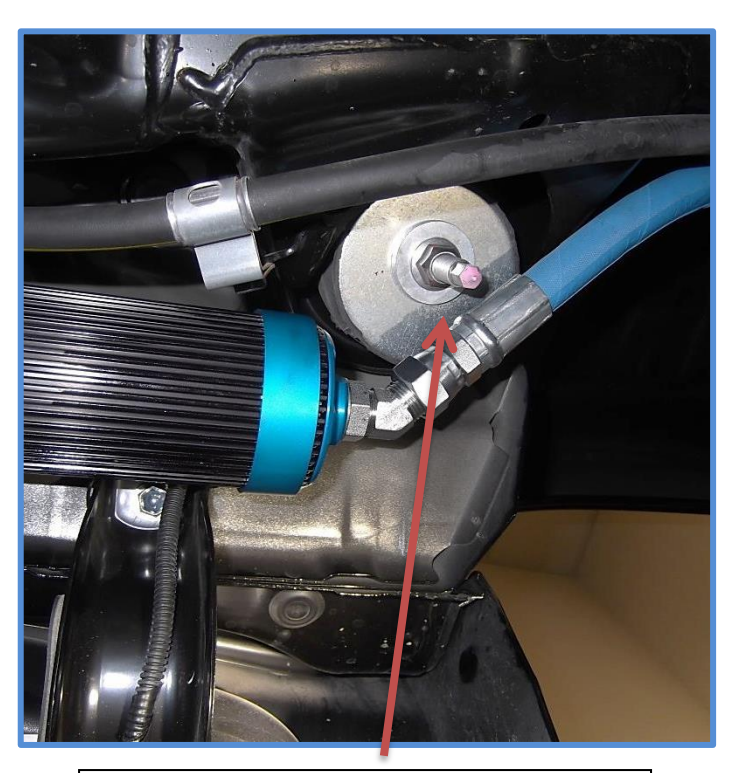
Make sure hose and fitting are not touching body mount

IMPORTANT: Read all instructions thoroughly from start to finish before beginning the install. Check parts list and make sure all parts are included in the kit. If the instructions are not properly followed severe frame, driveline and/or suspension damage may result. Check for frame and suspension damage prior to installation.