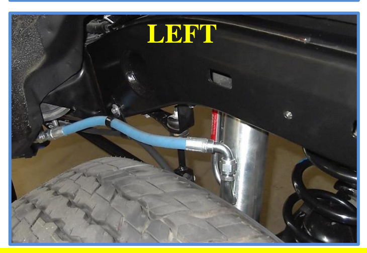
IMPORTANT: Read all instructions thoroughly from start to finish before beginning the install. Check parts list and make sure all parts are included in the kit. If the instructions are not properly followed severe frame, driveline and/or suspension damage may result. Check for frame and suspension damage prior to installation.