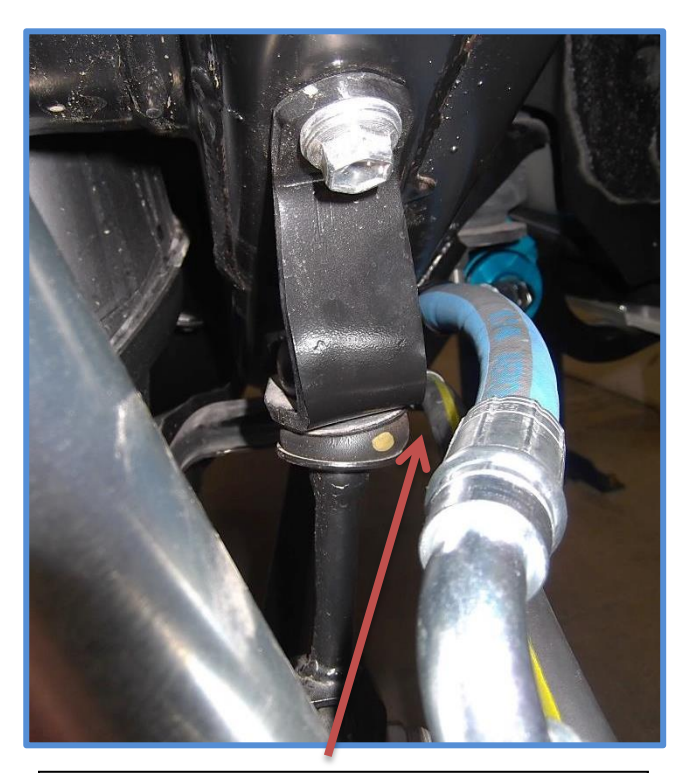
Make sure hose is not touching sway bar bracket or frame

12. Adjust hose: Make sure hose and or fittings are not in contact with frame or body mount. You can rotate the shock and or the reservoir or adjust hose as needed for a clean install. Shocks are built as close as possible to the required hose clocking but some adjustments may be necessary.